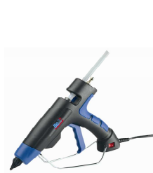
Hotmelt Gun e.g. BeA 285

Newly developed Polyamide glue is very effective and easy to use for repair of edges and corners. Knot holes are nearly invisibly filled. The Polyamide glue is sold in 10 various colours making repairs of almost any type of wood possible.