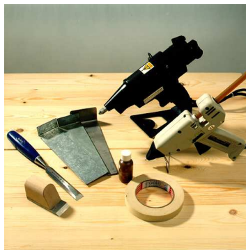
Tools for repair

When the surplus glue has been removed and the surface is clean and smooth, you can give the wood a finishing treatment of cellulose paint, lye or paint.