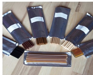
Choice of colours

Joh. Friedrich Behrens AG BeA Deutschland Befestigungstechnik